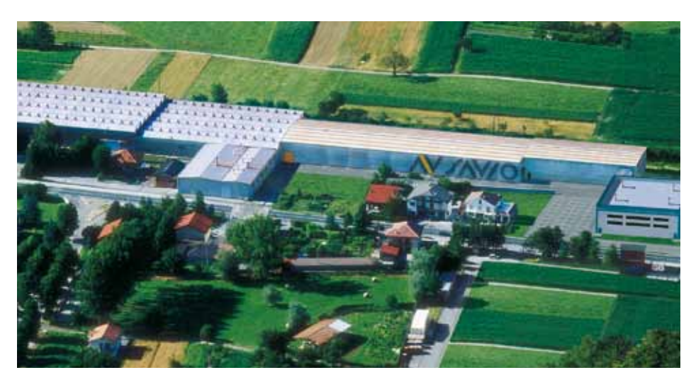
Headquarters in Chiusa San Michele, Torino, Italy

Main products: hinges, tilt and turn mechanisms, handles, panic-device systems.